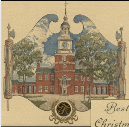
Greeting Card circa 1930 From the Collections of The Henry Ford