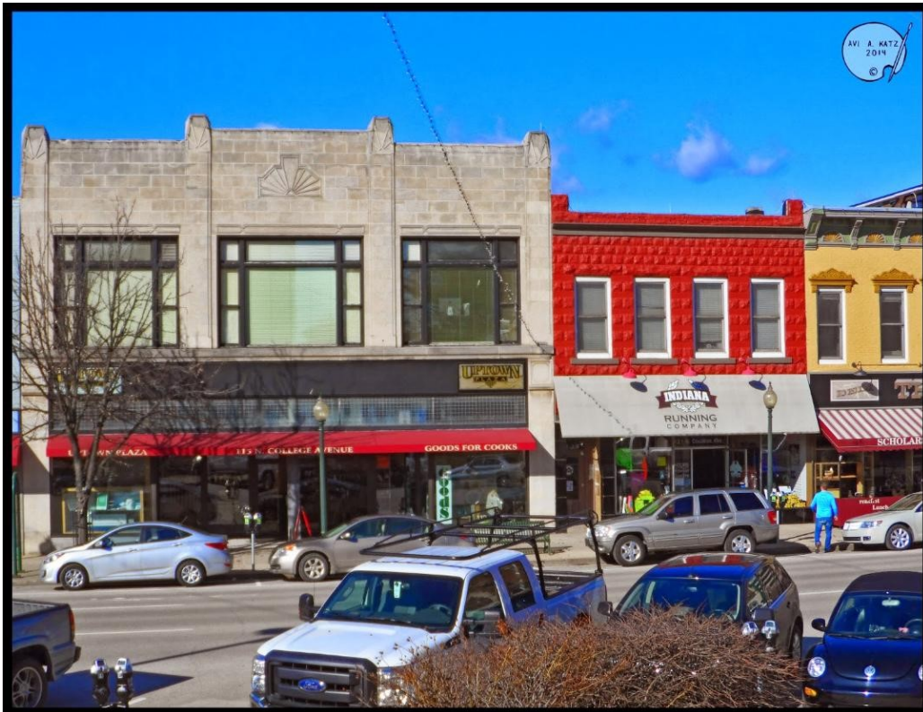
113 N College Ave, Bloomington, IN circa 1930